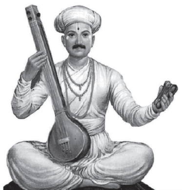
Indian sage Tukaram

8. Contemporary Humanism incorporates man’s continuity with the rest of life, and the rest of life with the rest of the universe. Thus the elimination of “absolutes” is now an attitude towards and an approach to man’s life and values confined to his life here on earth. The focus is: interest in man, concern for man,