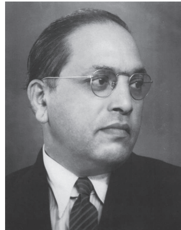
Dr Ambedkar, the father of the Constitution of India.

8. Restoration of the Theravadan Bhiksuni Order: The questions and concerns of restoring the bhiksuni Sangha in Thailand and elsewhere drew attention to human rights, in particular, the issue gender equality. Through