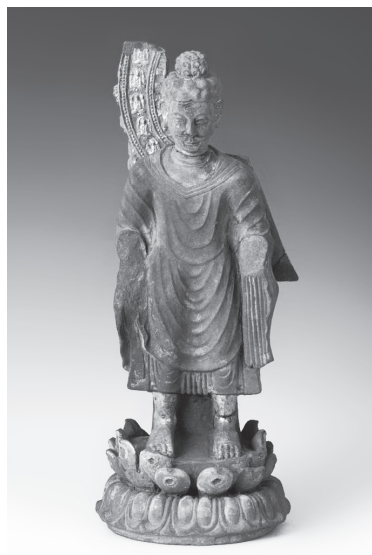
In Ancient India, King Ashoka ruled his kingdom based upon the principles of Buddhism. Pictured is the statue of King Ashoka in the Sichuan Museum Collection.

Buddhism exemplified itself as the earliest forms of religious humanism in the world. The “ideal world” in Buddhism is a world of bliss ruled by a compassionate and non-violent sovereign – a Chakravartin who does not rule by the use of arms, and does not conquer by force but by the means of