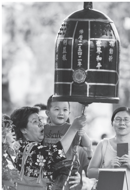
All teachings conducive to increasing the happiness of human life are Humanistic Buddhism.