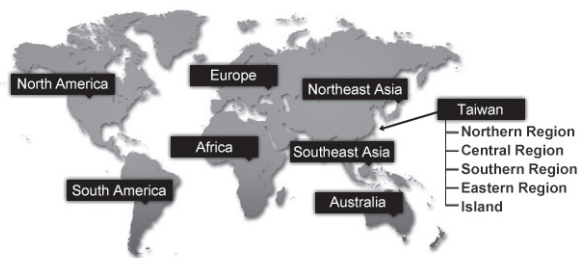
Map of Fo Guang Shan branch temples worldwide.

10. Venerable Master Hsing Yun: One of the most prominent Buddhist leaders who founded the Fo Guang Shan Order that is an umbrella to over 200 branch temples across the world with a following of two million followers. His ideal of Humanistic Buddhism aims at ensuring that Buddhism is relevant to and fits the needs of modern society so as to maintain spiritual and physical harmony from individual, interpersonal, family, societal, to the world levels.