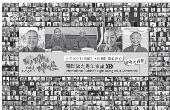
The 2020 International Buddha's Light Young Adult Conference hosted online, gathering 800 youths from 23 countries across 5 continents.

Catalyzed by the global pandemic, online Dharma propagation has reached far and wide. For example, I had the opportunity to preside over a "Taking Refuge in the Triple Gem Ceremony" online for 500 devotees from 20 European