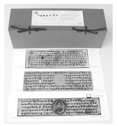
Sanskrit Lotus Sutra Manuscripts from the Institute of Oriental Manuscripts of the Russian Academy of Sciences, Facsimile Edition (2013)

appears to have been copied in Khotan.)* The Lotus Sutra manuscripts can be divided into the three lineages, namely, the Nepalese manuscripts, the Gilgit manuscripts, and the Central Asian manuscripts (or the two branches, the Gilgit-Nepalese and the Central Asian manuscripts), and the Petrovsky Manuscript is a representative of the Central Asian manuscripts. It is estimated to have been copied from the 9th to the 10th centuries and is an extremely valuable document