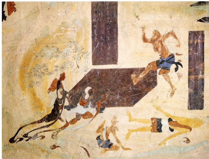
Fig. 5: Detail of Dunhuang Cave 323, north wall, showing heretic being punished for polluting the square boulder where the Buddha sunned his robe. 45

The Dunhuang painting actually is a pictorial illustration of this part of Xuanzang’s travel account. All of the above mentioned details are depicted: “the pool where the Buddha washed his robe,” “a large square stone” indicating the place where the robe was dried; “those of pure faith frequently com[ing] to make their offerings,” and, finally, the “heretic” or “man of evil mind” who “treads on this stone disdainfully” and is being punished by the god of thunder, identified by the drums surrounding his appearance, a Chinese adaption of the protecting dragon-king. All this is caused by the “traces of the kaṣāya ” 袈裟之迹, described in the cartouche text as “pattern or lines of twelve strips” 十二条文. The traces of the Buddha’s robe on the boulder are at the same time the cause for the sanctity of the place, and the cause for its protective qualities.