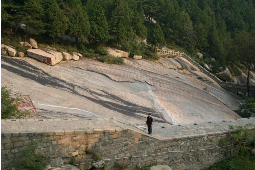
Fig. 3: Boulder with Diamond Sūtra in Sūtra Stone Valley, Mount Tai. HAW, 2006.

Such a monumental undertaking surely consumed both money and manpower, and it is self-evident that the text to be carved had to be selected carefully, and not in the least bit arbitrarily. The choice fell on the Diamond Sūtra , which was to be carved in its entirety. However, the carving could not be completed, as there are only very few characters or traces thereof left in the last columns of the text; in the end, close to two-thirds of Kumārajiva's text as contained in today's Taishō edition was finished.