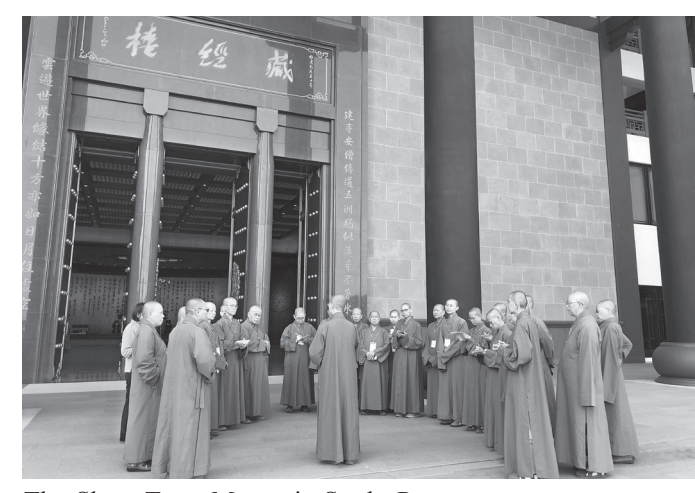
The Short-Term Monastic Study Program at the Sutra Repository offers all FGS monastic disciples a chance to further their studies.

The Short-Term Monastic Study Program held in the Sutra Repository offers a chance for all monastic disciples serving in different parts of the world to return to the monastery to further their understanding of Humanistic Buddhism. Youth Buddhist Academies established in branch temples globally, as well as the Dajue Cultural Training Program, have strengthened the number of talented young students entering Fo Guang Shan Tsung Lin University. Likewise, the 16 Buddhist colleges worldwide are also tireless in their efforts of fostering talents.