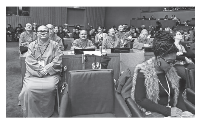
Fo Guang Shan bhiksunis gain public interest for their inaugural participation as an organization at the United Nations.

they need to possess a mind of equality.